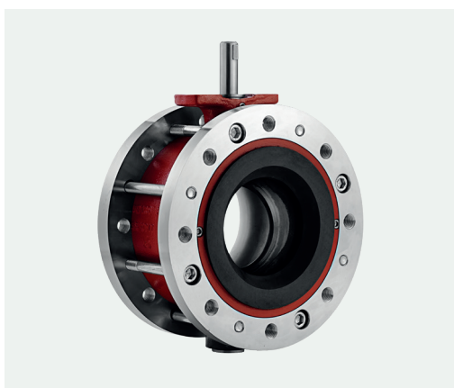
Ramén KSGF (Flanged end connection)